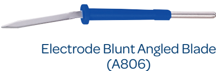
Electrode Blunt Angled Blade (A806)