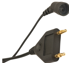
Reusable Bipolar Forceps Cord (A827V)