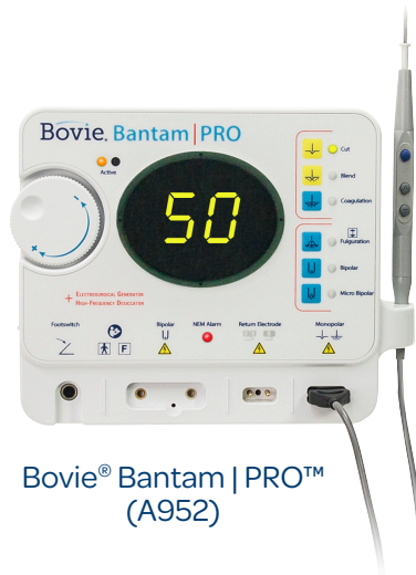
Bovie® Bantam | PRO™ (A952)