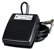
Foot Switch (A803)