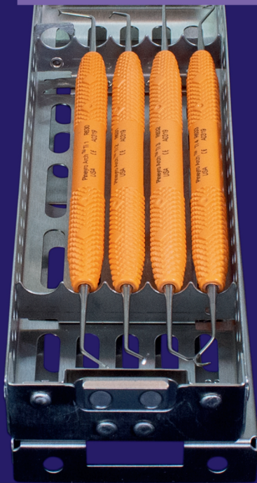
Pineyro Arch™ Kit