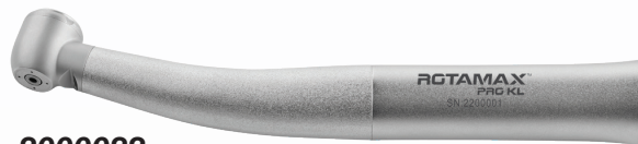
2000022 Rotamax™ Pro KL - Torque Head • Kavo Type Back End