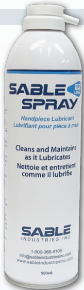
2200103 EZ Lube Spray 500ml