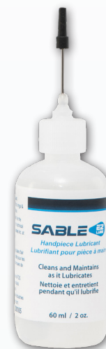
2200105 EZ Lube Dropper Bottle 60ml • 2oz