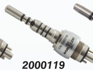
2000119 KAVO Type 6-Hole LED