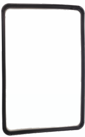
1700301 SciCan Statim 2000 Cassette Type