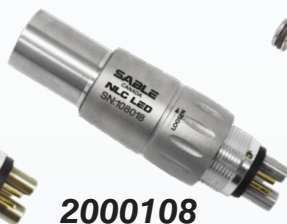
2000108 NSK Type 6-Hole LED