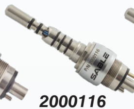
2000116 KAVO Type 6-Hole Halogen