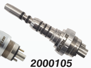
2000105 KAVO Type 5-Hole Multiflex