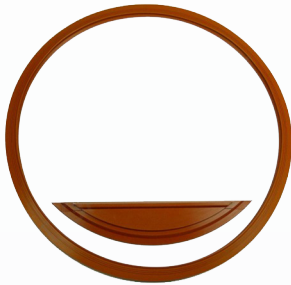
1700307 Midmark M11 Door Type Gasket Seal with Dam