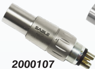
2000107 NSK Type 6-Hole Halogen