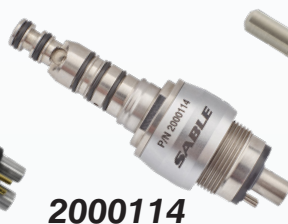
2000114 KAVO Type 4-Hole Non-Optic