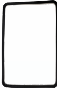
1700302 SciCan Statim 5000 Cassette Type