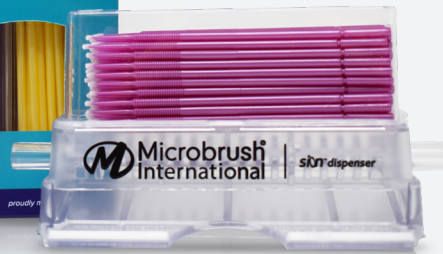
Microbrush® Disposable Micro-Applicators