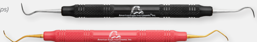
American Eagle Instruments