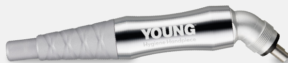
Young® Corded Hygiene Handpiece