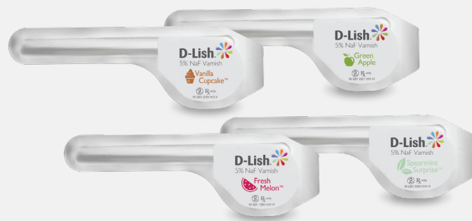
D-Lish® Fluoride Varnish