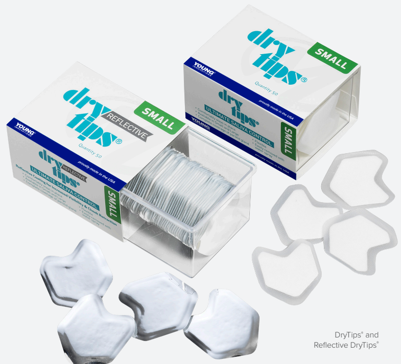
DryTips® and Reflective DryTips®